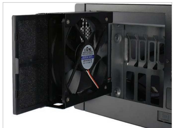
Easy maintain - Dust Filter