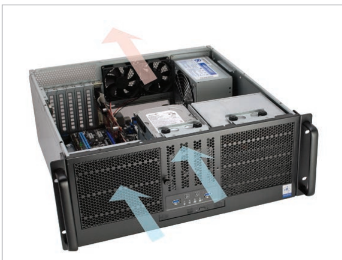
Excellent Air ventilation via front fans and rear fans pass through HDD zone, CPU zone and PCI card zone